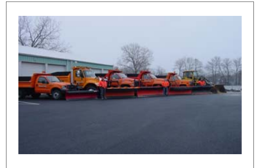
Village of Beach Park's Public Works Equipment

If you would like more information on snow plowing in the village, please contact the Village Hall at 847-746-1770. If for some reason there is a snow related problem, which occurs after hours, please call the same number and wait for the emergency prompt. Please remember, we are concerned about your safety. You can help by driving safely and be courteous to others. Enjoy the winter!!!!